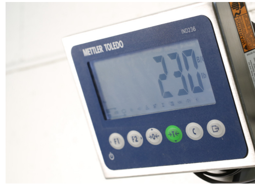
The user-friendly terminal features large display, various mounting and communication options.